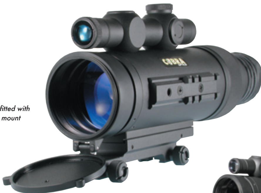
Sabre Pro™ fitted with Dovetail mount