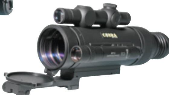
Sabre Pro™ fitted with extended Dovetail mount and optional High Power 75mW IR Illuminator (150mW also available)